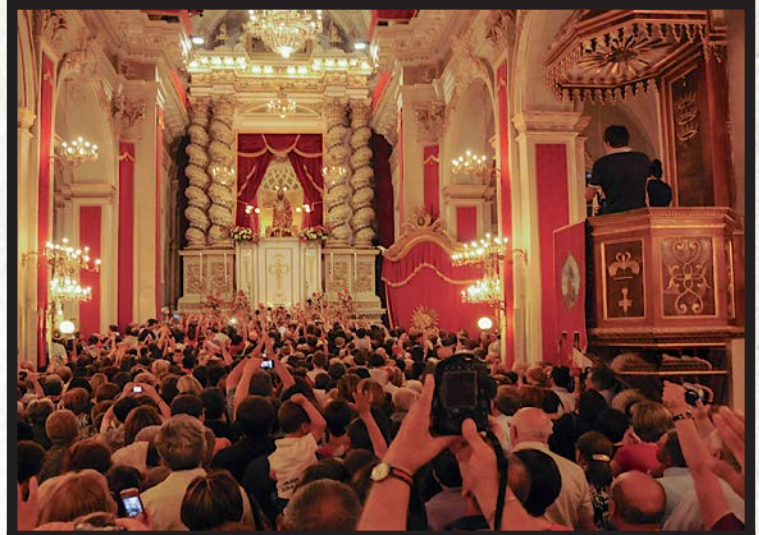
The Feast of San Paolo, honoring the Palazzolo Acreide patron saint, is typically held every year featuring holy masses, processions, fireworks, live music as well as arts and crafts.

According to tradition, St. Paul was bit by a viper, but the venom had no effect on him because of his supernatural powers. “San Paulu, maccia d’addauru, spina puncenti, nun muzzicari a mia e mancu a la genti” (St. Paul, laurel tree, stinging thorn, don’t bite neither me nor other